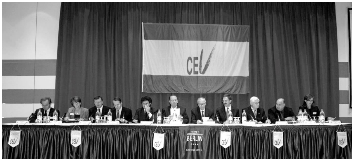
The CEV Executive Committee members and local authorities prepare for the opening of the 2003 General Assembly in Berlin