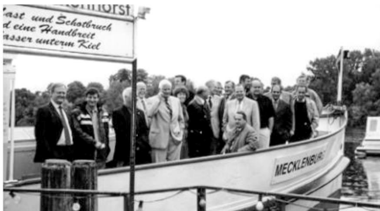
Members of the CEV Board of Administration enjoy a cruise in a break of their meeting in Schwerin, Germany