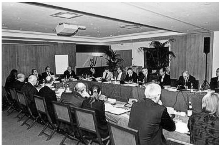
The CEV Board of Administration members in Paris for the first meeting of 2004