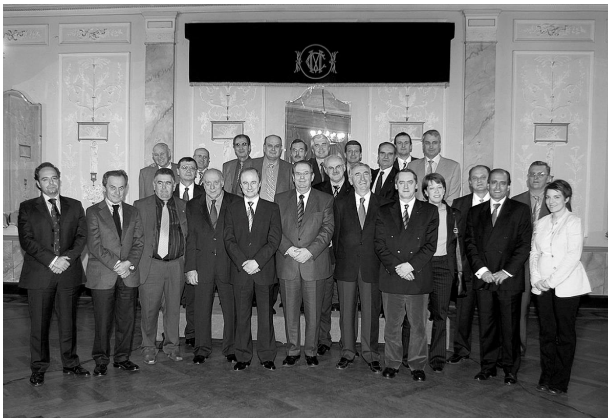
The members of the CEV Board pose at the end of their meeting held in Almeria in January 2005