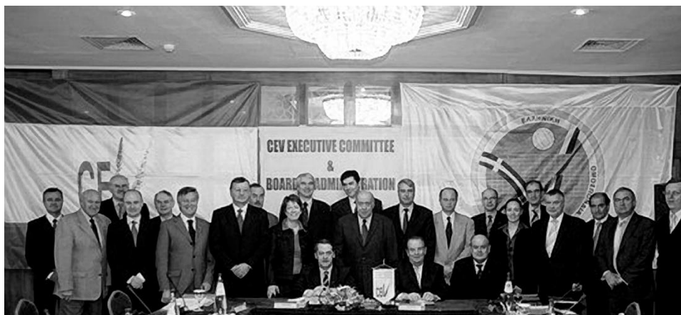
The members of the CEV Board of Administration pose at the end of their meeting in Athens