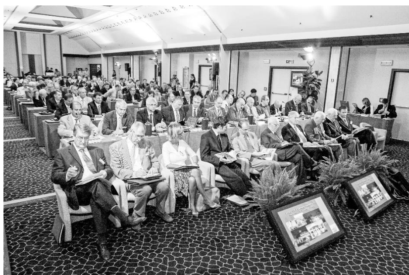
VIPs, Board members and delegates in attendance at the 2005 General Assembly in Rome