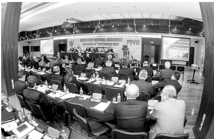
Delegates in attendance at the 2007 CEV General Assembly in Moscow