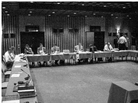
Working session of the CEV Board of Administration - Varna, (BUL) - June 2003

The commission also worked on detailing the basic principles relating the Zonal Associations and likely to guide their activities.