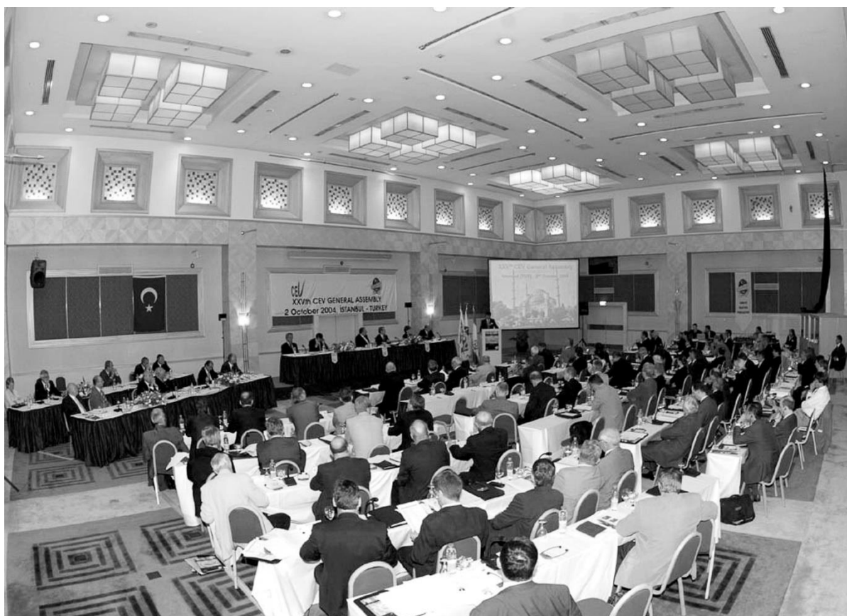
The 2004 CEV General Assembly was held in Turkey's megalopolis Istanbul

He is delighted with the constant improvement of the organisations and their impact on the media. The Olympic qualification tournament in Leipzig for men and in Baku for women