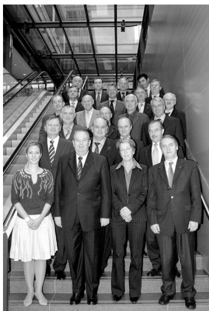
The members of the CEV Board of Administration portrayed at the end of their meeting in Luxembourg City